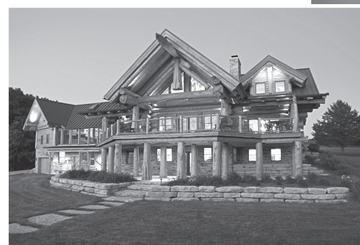
From furniture to log cabins, Everything Log, LLC is just what their name implies.