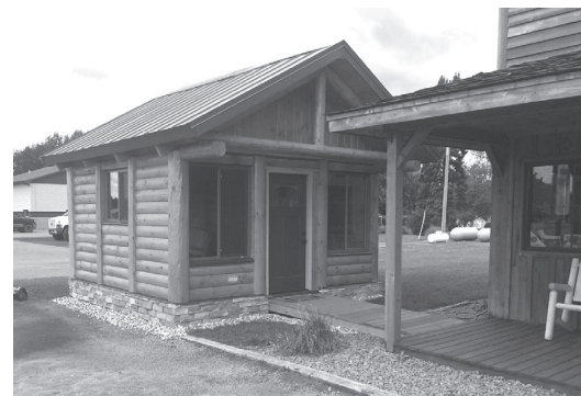
Model cabin at 103 Jones Avenue.